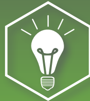
CREATIVITY & INNOVATION

Your ability to imagine, develop, express, encourage, and apply ideas in ways that are novel, unexpected, or challenge existing methods and norms. For example, we use this skill to discover better ways of doing things, develop new products, and deliver services in a new way.