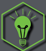
CREATIVITY & INNOVATION

Strong communication skills help you share information in a way that others can clearly understand. You also need strong communication skills to listen to, pay attention to, and understand others.